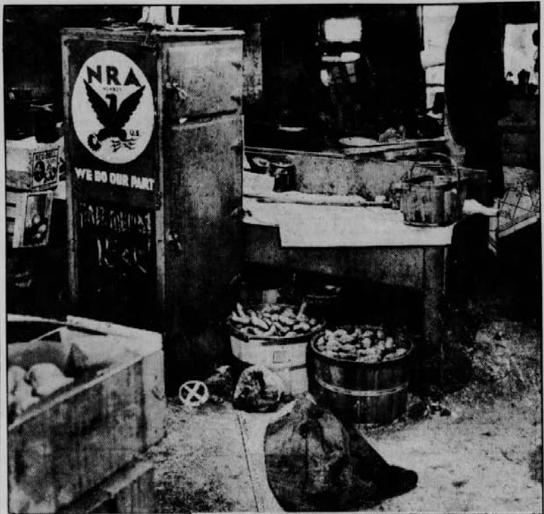
The white "X" in the upper picture locates the position of Dan Williams' head when officers found him shortly after 7 o'clock Friday morning in his fruit store at 916 N street. The fruit vendor's blood-stained cap and coat indicate the position of the body.

Below are shown instruments which police say may have been used by Williams' attacker. They include a hammer, a length of gas pipe and a scale weight.